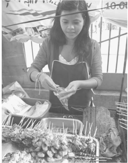
A street vendor selling chicken butt (tails) in Bangkok, Thailand.

Though many Asian countries seem relatively unconcerned with sweet desserts, the Thais have taken desserts to a whole new level with hundreds of brightly colored creations in jelly, marzipan, and rice. Some of the more popular deserts include the following: